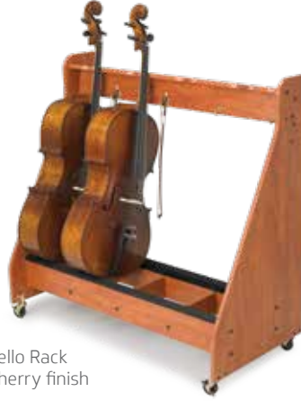
Cello Rack Cherry finish