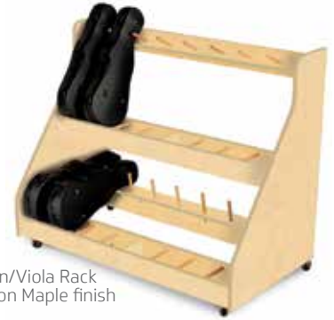
Violin/Viola Rack Fusion Maple finish