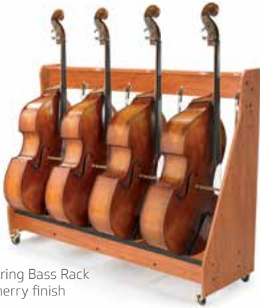
String Bass Rack Cherry finish