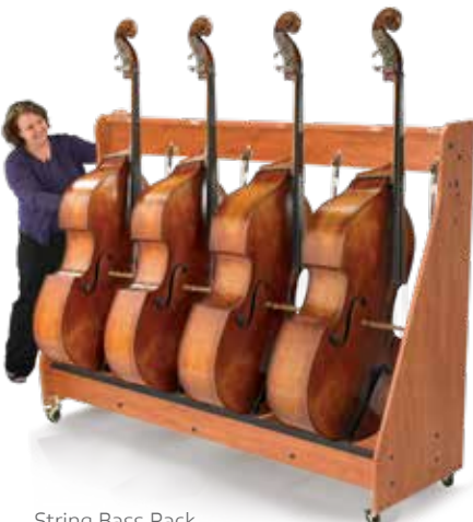
String Bass Rack

Protecting valuable instruments during transport and storage is at the core of Wenger Corporation’s product offering. And few instruments need to be cared for like your valuable string basses, cellos and violins. Wenger Corporation’s Stringed Instrument Mobile Storage Racks provide exceptional protection for these prized instruments. Soft rungs and supports cradle the instruments, protecting them from dings and scratches. And hard rubber swivel casters make rolling through doorways and anywhere in your facility easy. Please call your Wenger Corporation representative for more reasons why our Mobile Storage Racks are so perfectly tuned to your needs.